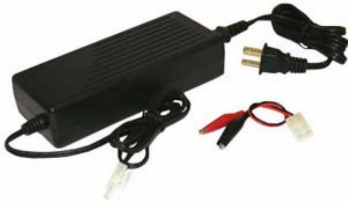
Figure 1: LED Indicator