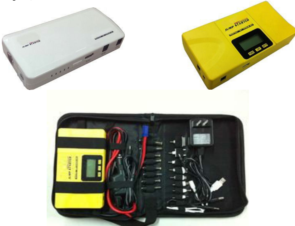
Fig.1 Jump Starter

The products are mainly used in Jump Starter, and also can be used in aircraft model, electric tools, robots, racing car, robot bomb and etc.